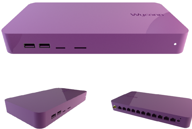
Wyconn Series 3000E