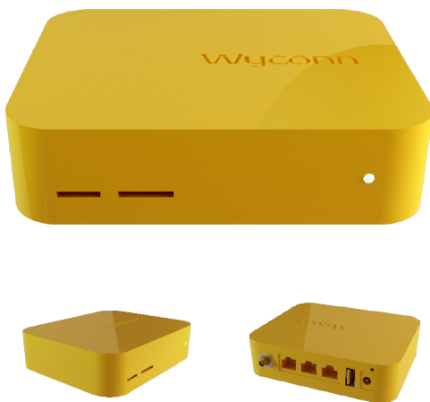
Wyconn Series 2000